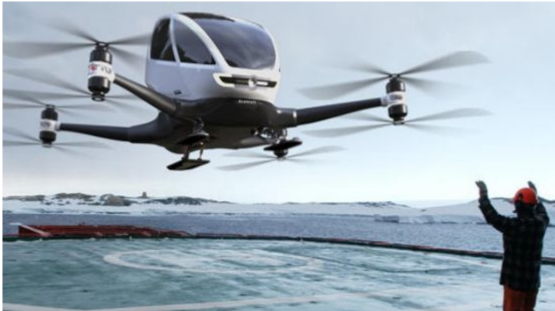
Fig. 4 Passenger drone prototype

Companies like EHang in China have already tested drones that carry people in the air through Dubai. These flying passenger drones are expected to be commercially deployed in the coming years. Other companies, such as Airbus, Uber, and Kitty Hawk, have proposed similar flying-car drones.