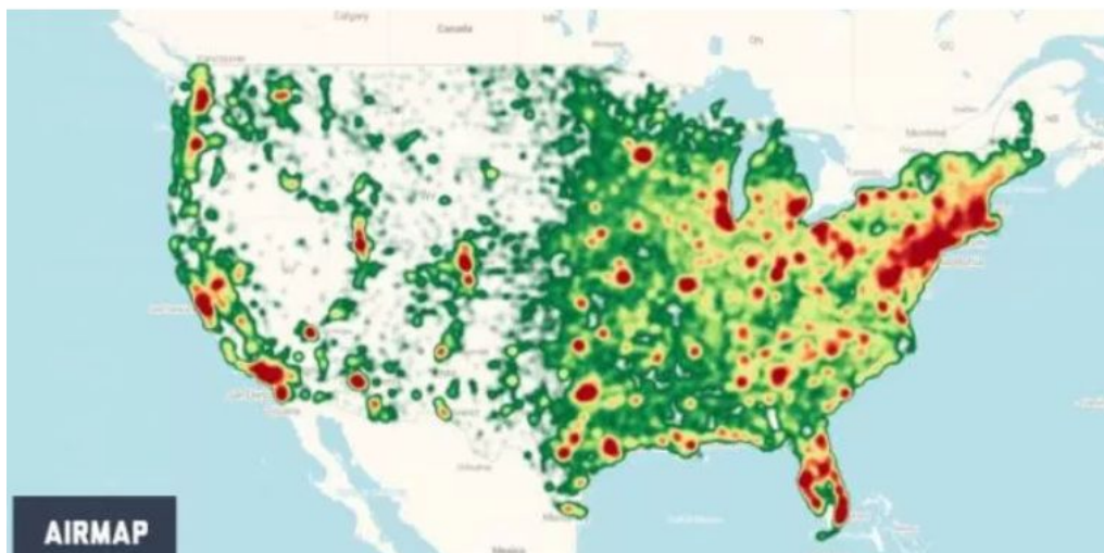
Fig. 7 - Heatmap of recreational and commercial drone registrations, FAA 2017

The following heat map from AirMap, the airspace management company, shows that 461,120 recreational drones and 8,416 commercial-use drones had been registered with the FAA by the end of May 2017.