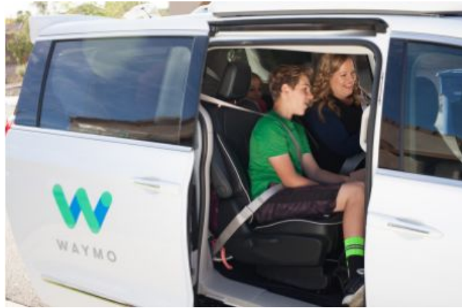
Fig. 6 - Waymo, self driving vehicle