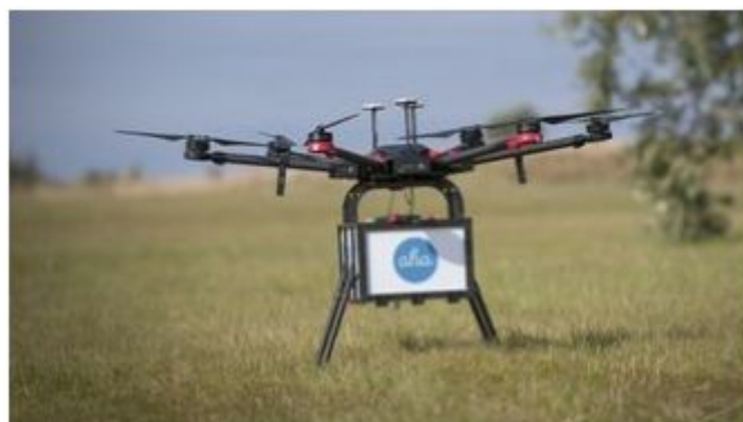
Fig. 3 - FlyTrex, autonomous drone delivering for Aha in Iceland

We already see companies like Flytrex executing deliveries with autonomous drones in Iceland for an Icelandic online marketplace called Aha.