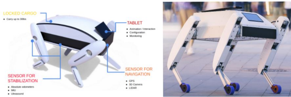
Fig. 1 - Aida, last mile autonomous delivery by Unsupervised.ai

Last-mile delivery represents 55% of the cost of a delivery today, due to manually taking a single parcel into the delivery destination, as opposed to driving a vehicle laden with a large volume of packages to near the destination. Companies are already developing hybrid systems for “integrated last mile” delivery, such as trucks that can arrive in a neighborhood and deploy both flying and wheeled drones.